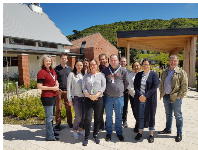
CaDDANZ researchers at the annual retreat, Our Lady's Home of Compassion, Island Bay, Wellington

significant component of the research is concerned with the implications of diversity for Māori and with how Māori engage with diversity. The research programme is comprehensive, multi-phased and organised around three themes: ethno-demographic diversity; societal impacts and opportunities; and institutional implications and responses.