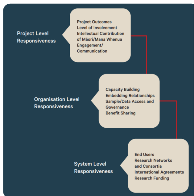
Figure 2. Responsiveness and engagement with Māori

While whānau, hapū and iwi can identify appropriate connections between taonga and kaitiaki, the nature of this involvement may vary from case to case. Individual projects, the organisations responsible for projects and researchers, and the systems within which the research is conducted all have responsibilities to engage with, include, and contribute to Māori (Figure 1).