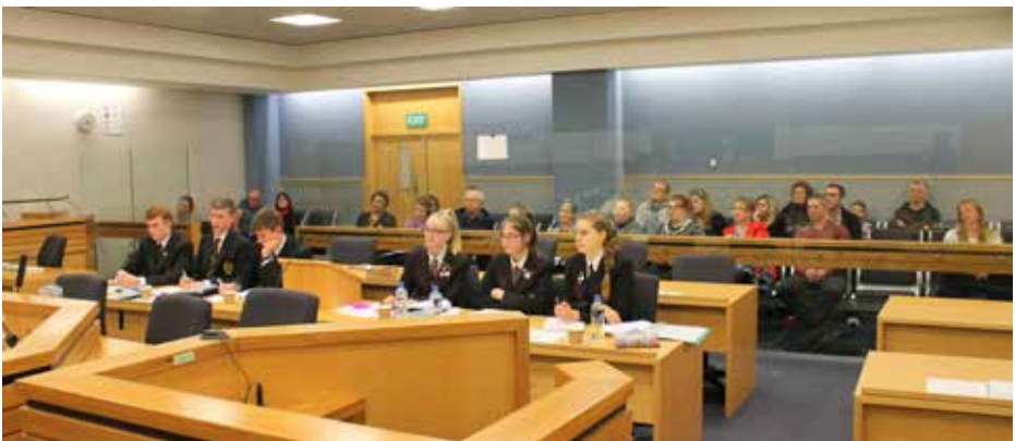
During the 2016 semi-finals held in Hamilton District Court

If you are stuck for an answer, it is perfectly acceptable to say “Your Honour, may I have a few moments to refer to my notes” or “Your Honour, may I have a few moments to confer with my counsel”. Alternatively, you might like to take a sip of water in order to give yourself time to consider an answer.