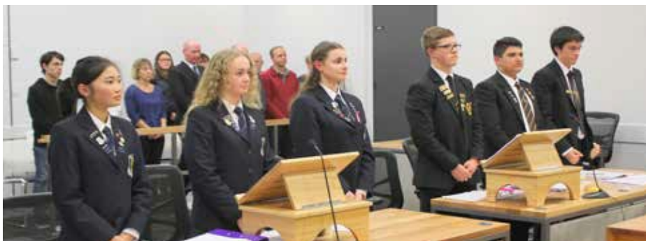
2017 Competition finalists before the winners are announced.

By constructing your arguments in this way, you will be able to lead the judge through your case in a logical fashion. However, you should note that the judge will ask questions during your presentation. The judge may not be interested in hearing your ideas in the order that you have